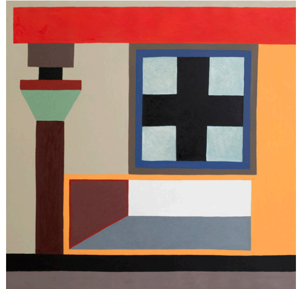
Image: Nathalie Du Pasquier, SOTTO , 2018, oil on canvas, 100 cm × 100 cm (39-3/8" × 39-3/8") © Nathalie Du Pasquier

Geneva — Pace Gallery is thrilled to present its third exhibition of works by Nathalie Du Pasquier at 15–17 Quai des Bergues in Geneva. On view from January 20 to March 6, 2020, the exhibition will feature over thirty recent works. Following its debut at Pace Gallery in Seoul in 2019, the strange order of things 2 will continue the artist’s exploration of themes of color, shape, and space.