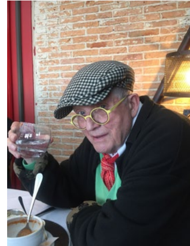
David Hockney in Normandy, 2019.

New York — Pace Gallery will inaugurate the third floor of its global headquarters with La Grande Cour, Normandy , an extraordinary exhibition of new drawings by David Hockney depicting the arrival of spring in the French countryside. This marks the first body of work created by the artist at his studio in Normandy, after which the show is titled.